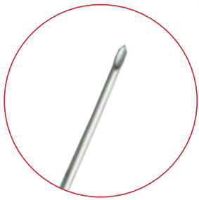
Half Moon Diamond Shape Bevel Cut